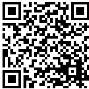
Back a Buddy

If you want to help our rehab initiative, to give more people a new chance in life, please donate to our Rehab Fund on Back-a-Buddy or directly into our bank account: FNB, Nemato Change a Life, 62256659461. Please use reference: "rehab".